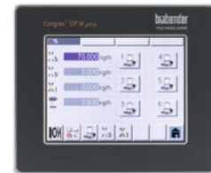
Congrav® OP M plus

When direct host/PLC communication is not used, multiple Brabender gravimetric feeders with Congrav® CB plus feeder control modules are operated by one of the Brabender touch screen human/machine interfaces Congrav® OP M plus (max. 6 feeders) or Congrav® OP 15 (max. 16 feeders).