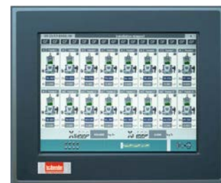
Congrav® OP 15

Please refer to the appropriate separate Works Standards for further details.