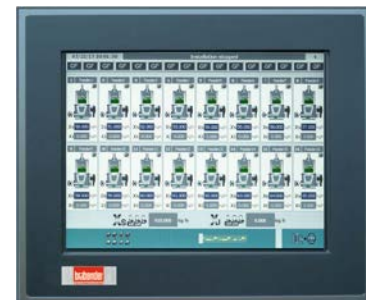
Congrav® OP 15

Please refer to the appropriate separate Works Standards for further details.