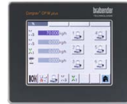
Congrav® OP M plus

Multiple Brabender gravimetric feeders with Congrav® CBS feeder control modules are operated by one of the Brabender touch screen human/machine interfaces Congrav® OP M plus (max. 6 feeders) or Congrav® OP 15 (max. 16 feeders).