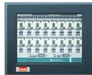
Congrav® OP 15

Please refer to the appropriate separate Works Standards for further details.