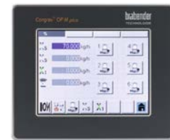
Congrav® OP M plus

When direct host/PLC communication is not used, Brabender gravimetric feeders with ISC plus modules are operated by one of the Brabender touch screen human/machine interfaces Congrav® OP M plus (max. 6 feeders) or Congrav® OP 15 (max. 16 feeders).