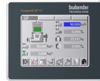
Congrav® OP 1T Operator Interface

The OP 1T can also be used for maintenance, troubleshooting and set up on individual "intelligent" Brabender feeders using ISC-CM plus technology in multiple feeder systems.