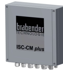
ISC-CM plus control module