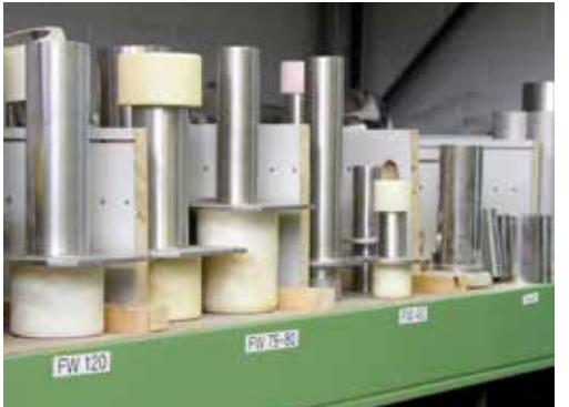
Screw tubes in the spare parts warehouse