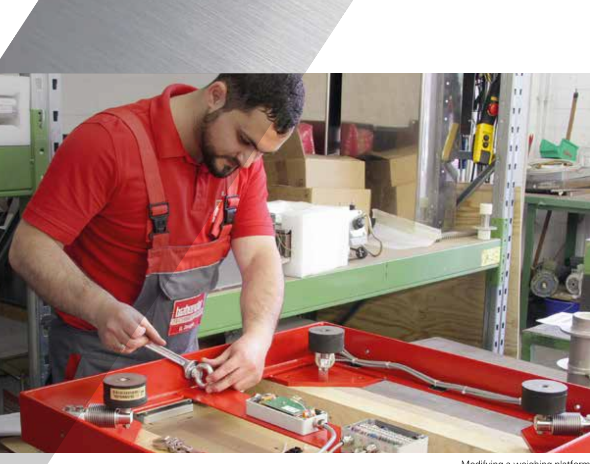
Modifying a weighing platform