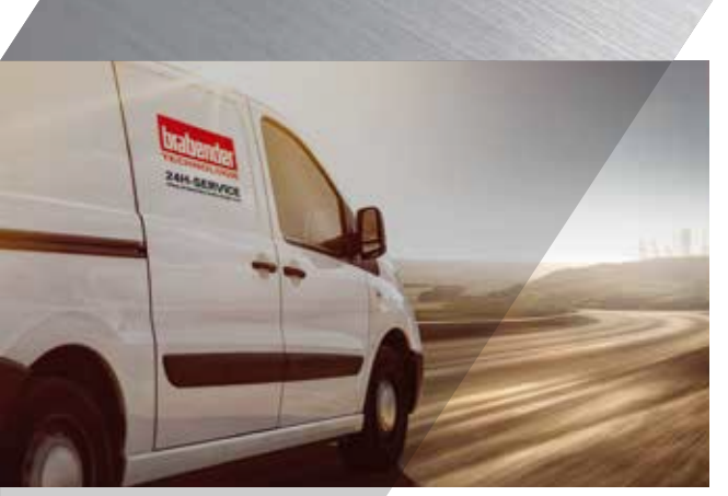
Our engineers set off straightaway to reach your premises