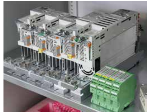
Electronic components in stock