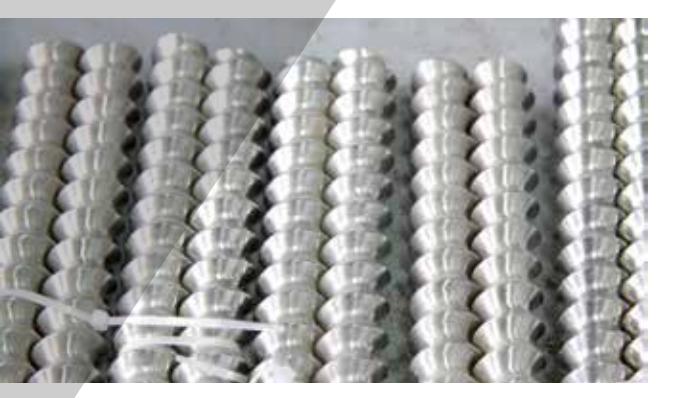
Twin concave screws