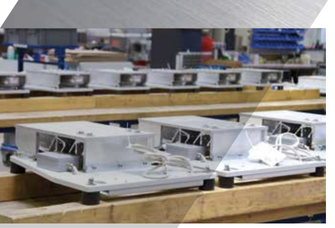
Load cells ready to be used