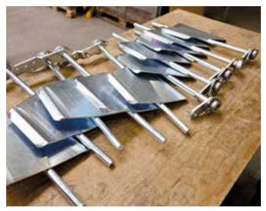
Always the right spare part